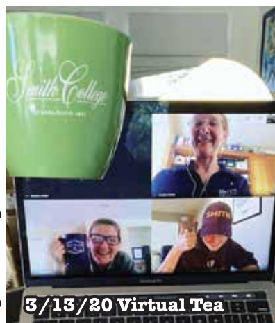
3/13/20 Virtual Tea