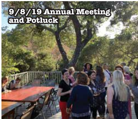
9/8/19 Annual Meeting and Potluck