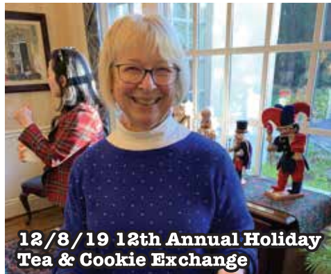
12/8/19 12th Annual Holiday Tea & Cookie Exchange

GO TO THE BOOK CLUB SECTION IN THIS NEWSLETTER TO SEE WHAT WE'VE BEEN READING, AND WHAT'S COMING UP NEXT!