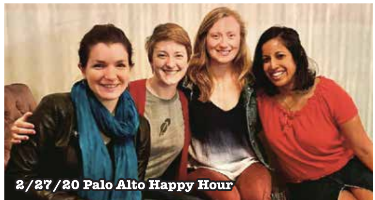
2/27/20 Palo Alto Happy Hour