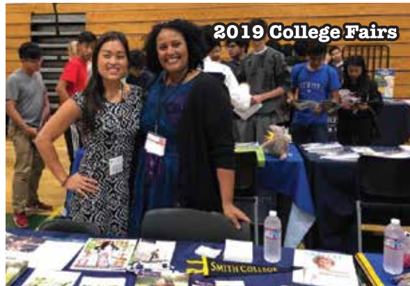
2019 College Fairs