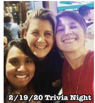
2/19/20 Trivia Night