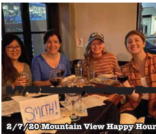
2/7/20 Mountain View Happy Hour