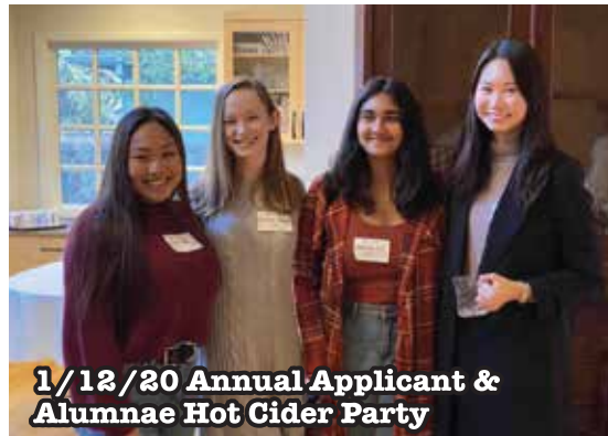
1/12/20 Annual Applicant & Alumnae Hot Cider Party